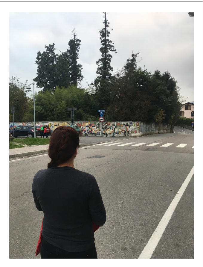
The picture shows the woman described in case 5, who was diagnosed with PTSD and with a high risk of suicide prior to being transferred from Switzerland to Italy. She was not accommodated until 14 days after the Dublin transfer, after which she was accommodated as the only single woman at a CAS centre with about 40 men.

The interviewer from the DRMP was informed by staff at the CAS centre that she should expect to stay at the centre for a long time and therefore intervened in her case. The interviewer, who is an Italian lawyer, contacted the Questura and on 9 May 2018 she was transferred to an all-female CAS centre. This CAS centre accommodates only 9 asylum seekers in total and she shares a room with a single mother and her baby. All the women cook