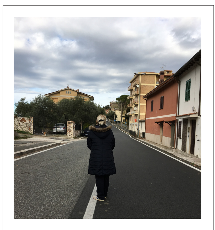
The picture shows the woman described in case 8, who suffers from complex trauma and whose mental health deteriorated following the Dublin transfer, after which she was accommodated at a large CAS centre.

The police then provided her with an asylum request form, a temporary permit to stay in Italy, a notification of the day of her appointment with the Questura and a notification of the day