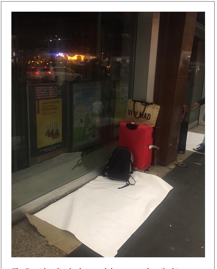
The Danish police had warned the woman described in case 2 that she might have to sleep on the streets in Italy after the Dublin transfer. She had therefore brought a blanket with her from Denmark, which she used to stay warm when she had to sleep outside Termini train station in Rome. The picture was taken by the woman and sent to the DRC.

After three months at the CAS centre, an Italian NGO put her in contact with an Italian woman (private person) whom she could stay with for two weeks. To pay the woman she worked for three weeks at a restaurant in Rome, where the owners refused to pay her, wherefore so she only received tips from customers. When she had to leave the woman, the same Italian NGO put her in contact with an Italian family whom she stayed with for one month. Thereafter the NGO found a family whom she stayed with for approximately two months in exchange for domestic work 30 hours a week. In the end she felt abused and found the situation in the house so unpleasant that she returned to the CAS centre after she had been granted interna-