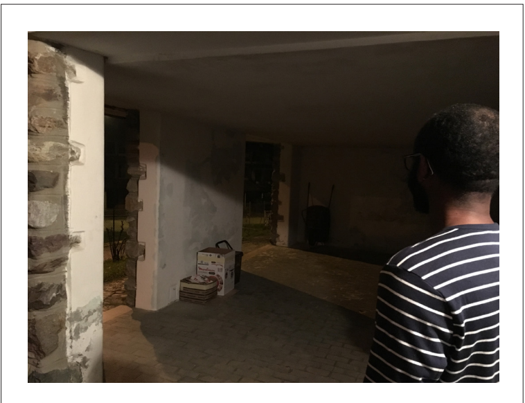
The picture shows the male victim of human trafficking described in case 12. Despite being a victim of human trafficking, he has lost the right to accommodation twice since the Dublin transfer, and now lives on the streets in Italy.

Prior to entering Italy, he had been sold twice in Libya. In Italy, he was detained in an apartment building together with other men and women. He was detained by the trafficker who had brought him from Libya. The traffickers said the trafficked persons owed them money and had to repay by working as prostitutes or by selling narcotics. After two weeks he managed to escape and reached Germany. In Germany he met persons from the same trafficking network. They beat him and gave his phone number to the trafficker in Italy, who then threatened him on the phone. Feeling unsafe in Germany, he traveled to Denmark, from where he was returned to Italy. To help him be recognized as vulnerable by the Italian authorities upon arrival, the Centre Against Human Trafficking in Denmark had issued him a note stating that he is identified as a victim of human trafficking.